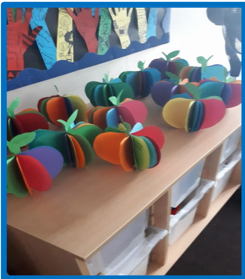
Year 6 “apples”